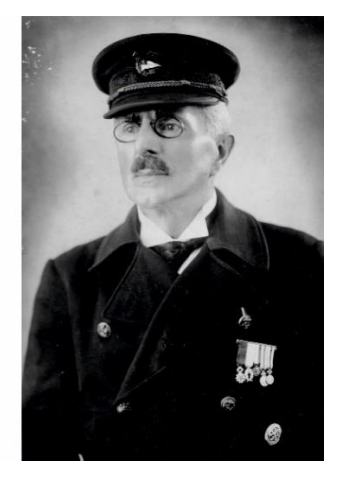
Josef Rössler-Ořovský as a sports official at a later age<sup>65</sup>