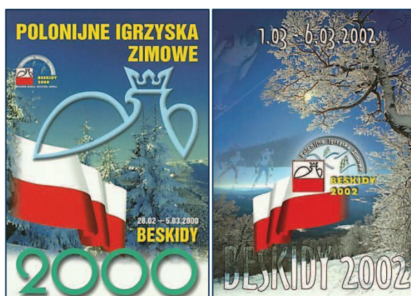
Fig. 4, 5. Front pages of bulletins of the 4th and 5th World Polonia Winter Games

The World Polonia Winter Games 'Beskids 2000' smoothed the way for the organization of subsequent Polonia sports meetings, which was due to the Bielsko-Biała Branch of 'Polish Community'. The next four winter games, carried out in the new formula, were again held in the Beskidy and Silesia 12 .