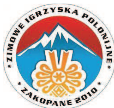
Fig. 11. The badge of the 9th World Polonia Winter Games. Zakopane 2010.

Source: http://wiadomosci.wspolnotapolska.org.pl/blog_imprez/19/wiatowe-Zimowe-Igrzyska-Polonijne-LSK-BESKIDY-2008 [accessed: 3.11.2016].