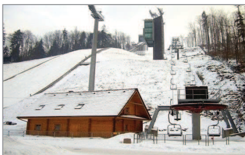
Fig. 8. 6th World Polonia Winter Games. Szczyrk 2004.