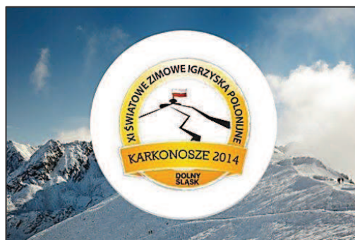
Fig. 15. Poster of the 11th World Polonia Winter Games