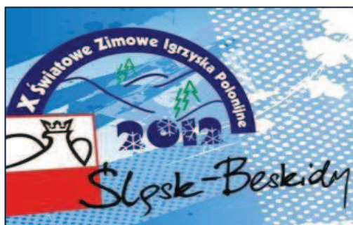
Fig. 14. Poster of the 10th Jubilee World Polonia Winter Games