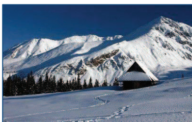
Fig. 3. The 3rd Polonia Winter Games. Zakopane 1992