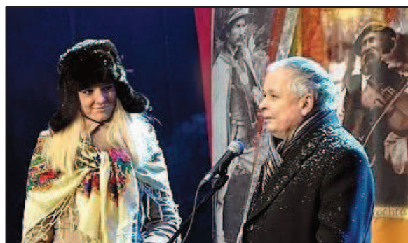
Fig. 12, 13. Opening ceremony of the 9th World Polonia Winter Games in Zakopane (2010), attended by the President of the Republic of Poland, Lech Kaczyński