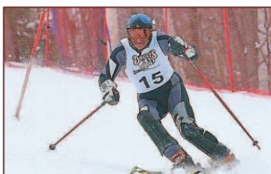
Fig. 1. The 1st Polonia Winter Games. Zakopane 1986