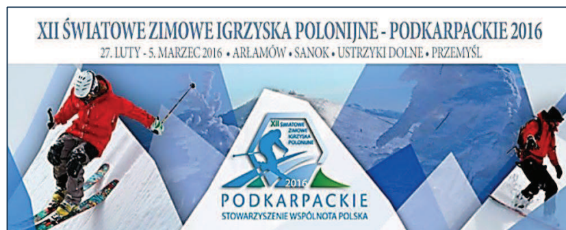
Fig. 18. Poster of the 12th WPWG. Podkarpackie 2016