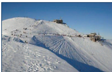
Fig. 2. The 2nd Polonia Winter Games. Zakopane 1989