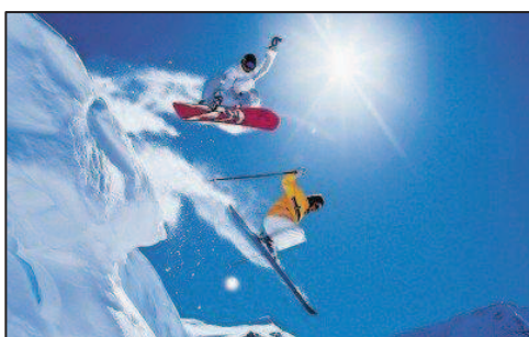
Fig. 7. 5th World Polonia Winter Games. Szczyrk 2002.