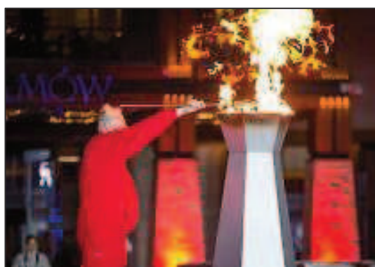
Fig. 16, 17. Opening ceremony of the 12th World Polonia Winter Games in Arłamów