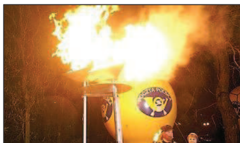
Fig. 10. Opening ceremony of the 8th World Polonia Winter Games. Szczyrk 2008.

fication with a total of 42 medals, the Polonia athletes from Russia took the second place with 30 medals, and the third place went to the Swedish Polonia representatives, who won 26 medals 20 .