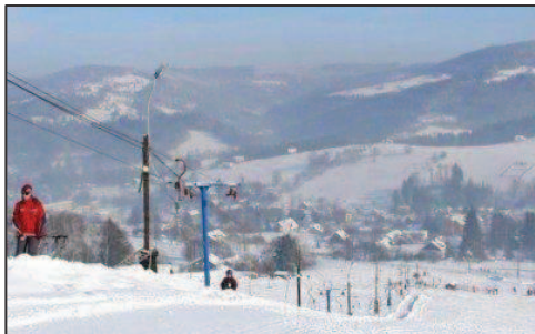
Fig. 9. 7th World Polonia Winter Games. Szczyrk 2006.