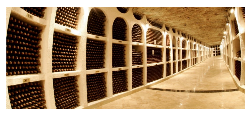
Figure 1. The Underground Complex

Though being located under the whole town of Cricova, the galleries represent a real underground town with streets, traffic lights and road signs. The streets are named according to the name of the wine that is kept in the adjacent niches: Cabernet, Dionis, Feteasca, Aligote, Sauvignon, etc.