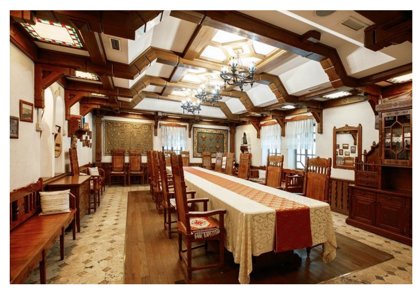
Figure 3. The Room Casa Mare