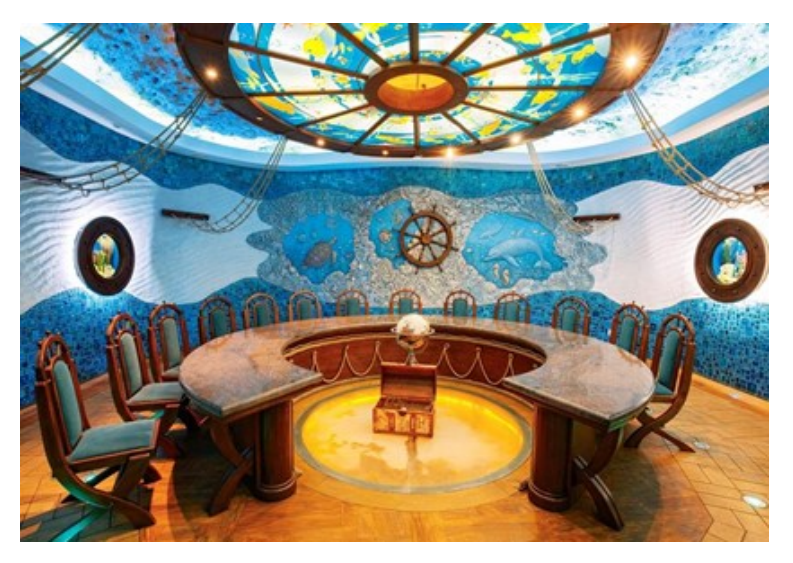
Figure 2. The Bottom of the Sea Room

V. The Room Casa Mare – the place that bears the name of the most beautiful room of a traditional house in the rural area of Moldova (Figure 3). The room is decorated with oak furniture and national motifs. The rustic atmosphere predominates in this room due to the wooden ceiling with beams, which creates the impression of antiquity.