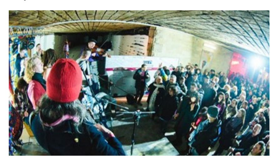
Figure 5. Underland Wine & Music Fest