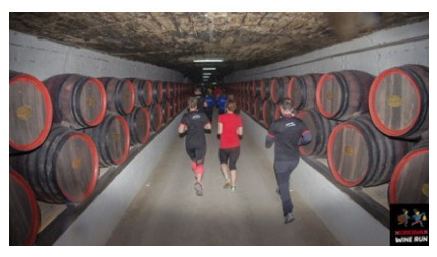
Figure 4. Cricova Wine Run