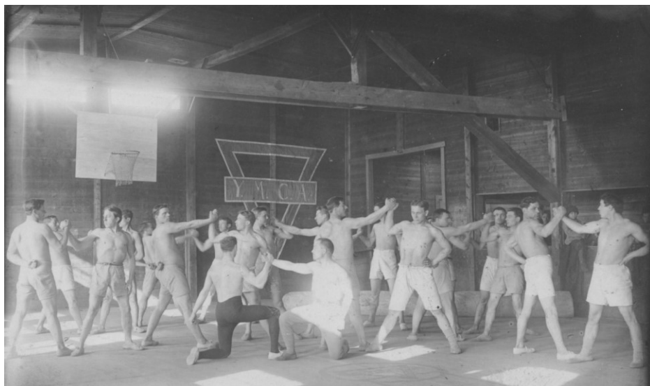
Pic. 2. A group of men practising in the gym (March 1st, 1922)

The equipment and sports clothes were delivered by the YMCA. The participants tried to make up for the lacking equipment on their own. In the picture, you can see kettlebells and axels. After closing down the camp in Strzałkowo, the YMCA mission was relocated with the interned people to scouts' school (płastun school) in Szczypiorno. There, apart from obligatory subjects, they put special attention to military training and physical education. It was YMCA again which equipped the school. An instructor of gymnastics, volleyball, basketball, football, athletics and boxing was employed.