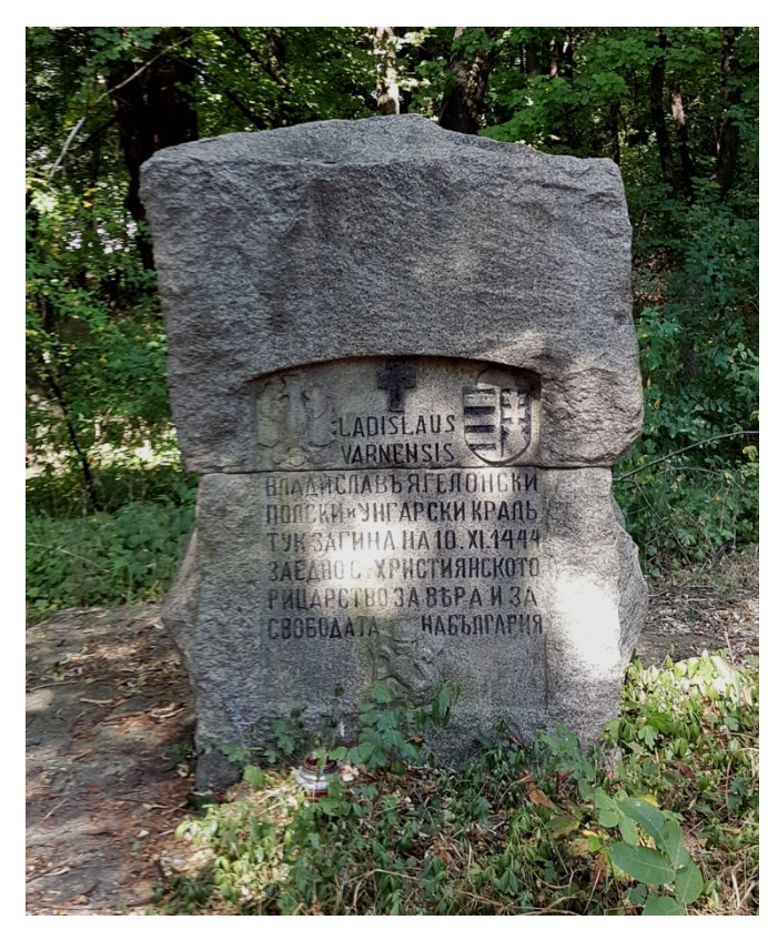
Fig. 1. Monument from 1924 by Michailo Paraszczuk

knights fighting for freedom and faith of Bulgaria on 10.11.1444". There are also coats of arms of Poland, Hungary and Bulgaria. After 11 years, during construction of the Park-Mausoleum of Ladislaus of Varna, the monument was transferred to the foot of the barrow. It is the oldest artefact preserved till the present day and it is only regrettable that it is placed somehow on the sidelines of the main facility.