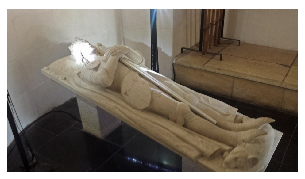
Fig. 4. Copy of the tombstone of the Wawel sarcophagus with a figure of Ladislaus of Varna – the original version by Antoni Madeyski from 1906

A tourist must stop in front of the magnificently exposed replica of the tombstone of the sarcophagus of Ladislaus III of Varna, whose original version is in the Wawel Cathedral (fig. 4). The sculptor who was working on that piece of art was Antoni Madeyski – born in Wołyń, but living in Italy his later life. The original sarcophagus is a symbolic grave of our fallen king, and an excellent design and its artistry made Bulgarians make a replica. The first attempt was, unfortunately, unsuccessful, because when the king's figure, made from marble was almost finished, there appeared a crevice in it. A decision was made then about making the copy not from marble but from white stone from the vicinity of Wraca (Vratza or Vraca). The work was finished in 1971 and given to the above-mentioned museum. Earlier there was the king's bust by Hristo Boew (Boev), which had been exhibited in its northern recess from 1967. After finishing the copy of the sarcophagus tombstone with a figure of the king and exhibiting it, the bust was moved to the War Historical Museum in Sophia.