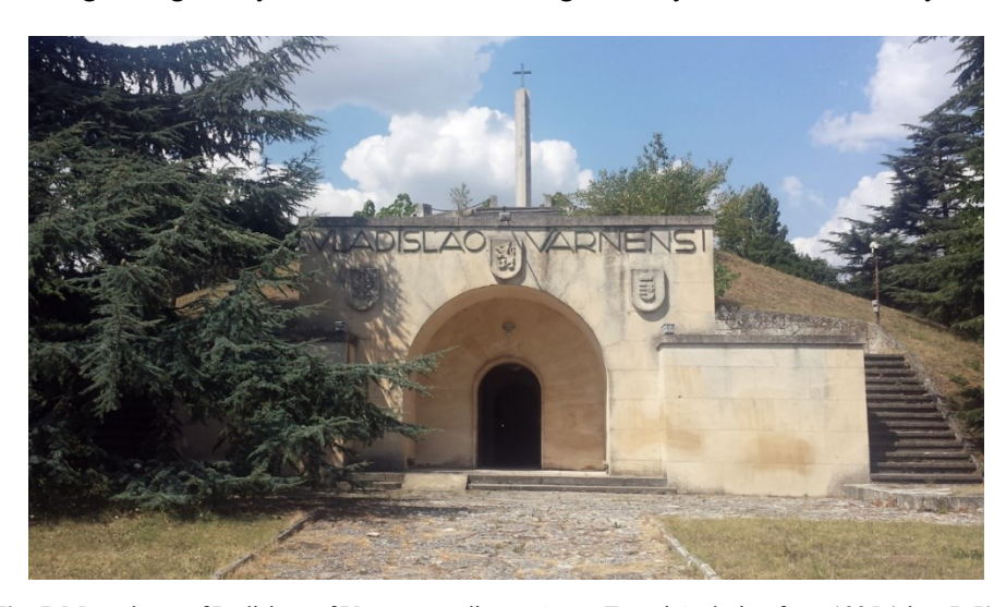
Fig. 5. Mausoleum of Ladislaus of Varna according to Anton Frangia's design from 1935

His conception turned out to be better than a project sent from Poland. Implementation of the Polish project would require gigantic financial means, which the initiators of the endeavour did not have at their disposal. A. Frangia proposed reconstruction of the southern barrow with a magnificent entrance and an inscription VLADISLAO VARNENSI with coats of arms of Poland, Hungary and Bulgaria over it (fig. 5). The conception of an inscription by the above mentioned Michailo Paraszczuk from his 1924 monument was also used. As a matter of fact, the mentioned monument was moved from the top of the barrow and replaced by a big cross brought from Poland in 1935. In his youth A. Frangia studied in Poland and then he was a Polish honorary consul in Varna. there are still many buildings designed by him in Varna and delight our eyes with their beauty.