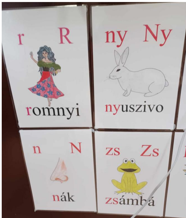
Figure 1 The translanguaging display in Erika's classroom

Assessing how parents would react if the Romani language appeared in everyday school practices was necessary. As a first step, alongside the Hungarian language flashcards, Erika displayed Romani language flashcards in the classroom when teaching letters. This is how she welcomed the pupils on the first day of school. When parents entered the classroom, they were surprised but interested. They immediately became engaged with the display as they read the Romani language flashcards. The parents found it amusing because it was the first time for many of them to see their local ways of speaking written in the school. Also, one parent had not even seen the words they use daily written down.