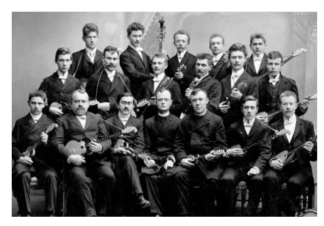
Picture 1. The profile photography: Tambura players of Catholic Workers Unit, Hradec Králové in the year of 1903