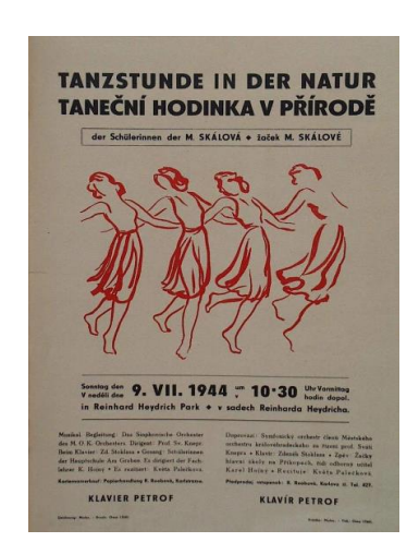
Picture 2. Invitation to private school events during the Second World War