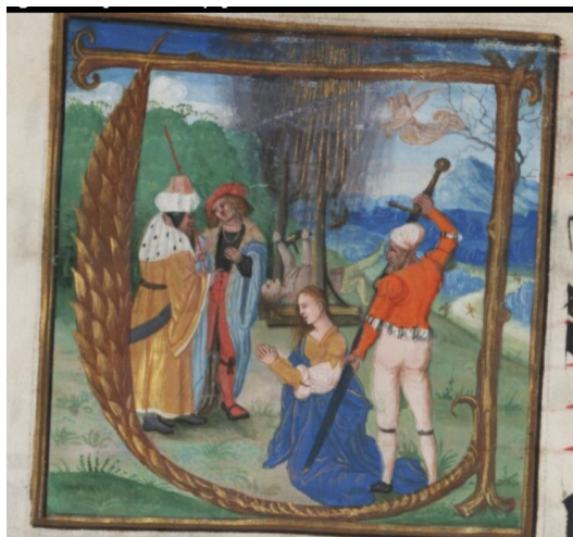
Figure 10. The scene of beheading incorporated into the initial V ( irginis eximiae ). Gand, Universiteitsbibliotheek, ms. BKT. 6. Brabantine antiphonary (1522), f. 329r.

The scene of sentencing Saint Catherine to death by beheading is shown in Figure 10. The miniature was incorporated into the initial V ( irginis eximiae ). It is an opening antiphon found at the beginning of the office for Saint Catherine in