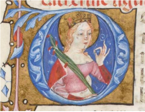
Figure 2. Image of Saint Catherine with attributes incorporated into the initial D ( eus qui dedisti ). Paris, Bibliothèque Nationale de France, ms. NAL 3255. Dominican breviary of Louis X (1st quarter of the 14th century), f. 540r.