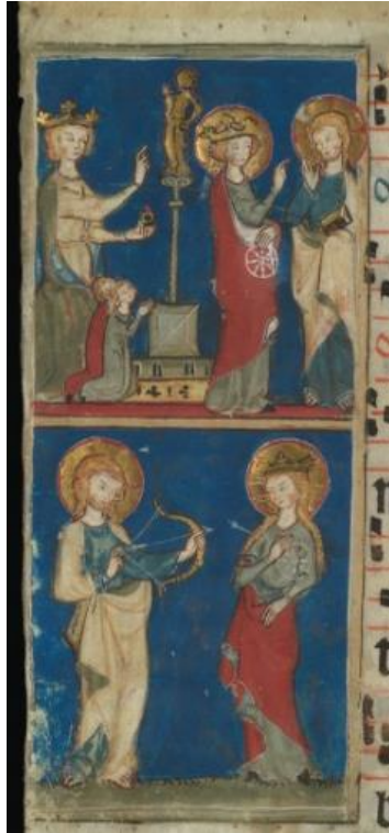
Figure 5. Upper panel: the scene of refusal to make a sacrifice to pagan gods; lower panel: the scene of the mystical marriage. Frauenfeld, Historisches Museum Thurgau, ms. T 44414. Fragment of a page from a Cistercian antiphony (1310–1320), f. 1v.

According to the hagiography, Catherine received a comprehensive education and was regarded as a scholar. In miniatures referencing her early life, the attribute of a book appears as a symbol of wisdom and knowledge. The miniature reproduced in Figure 4 shows the full figure of Catherine dressed in a long red gown adorned with a white floral ornament. The Saint is part of the initial composition of the letter V(irginis eximiae) . It is analogous to Figure 3 except for the fact that it is found in an antiphony – a book with musical notation. In her right hand, she wields a sword, a symbol of martyrdom, while in her left hand, a book with golden pages. The Saint has golden hair and a crown on her head, again surrounded by a halo. The background is rendered in the same colour as the book, and additionally embellished with a golden ornament and a red and golden decorative border.