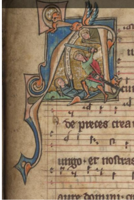
Figure 11. The scene of beheading incorporated into the initial A ( ve virgo speciosa ). Nürnberg, Germanisches Nationalmuseum, ms. 4984. Premonstratensian antiphony from Varlar (2nd half of the 13th century), p. 524.

a Norbertine antiphony from Brabant. The initial consists of golden and brown floral and faunal motifs; the composition is closed and exhibits linear perspective.