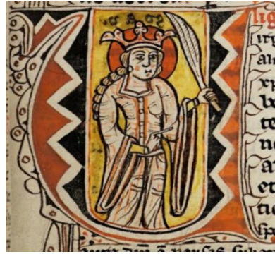
Figure 3. Image of Saint Catherine with attributes incorporated into the initial V ( irginis eximiae ). Graz, Universitätsbibliothek, ms. 789. Benedictine breviary from Seckau (14th century), f. 333r.

Catherine is dressed in a pink gown, holding a green branch in her right hand, while her left hand is slightly raised. She has golden hair and a crown, as well as a halo of the same colour. The full figure of the Saint was depicted against a golden background in Figure 3, which is part of the initial composition V ( irginis eximiae ). It is a very popular antiphon opening the office for Saint Catherine. In this case, there is no written melody since the source is a breviary. Surrounded by a red halo, her head is adorned with a crown of the same colour. A golden braid falls over her right shoulder, and in her left hand, the Saint holds a sketched branch. She is dressed in a long gown with wide sleeves.