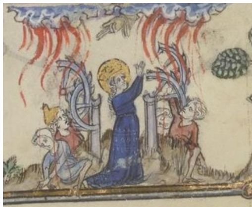
Figure 9. The scene of Saint Catherine's miraculous deliverance from torture. Praha, Národní knihovna České Republiky, ms. XII.E.1. Breviary from Prague, pars aestivalis (1366–1385), f. 204r.

readings and responsories of the first nocturn. The illustration is not part of an initial. It depicts the Saint in a dark blue gown with a golden crown and a halo, kneeling and raising her hands towards the sky. Flames rain down from blue clouds in the heavens, destroying the instrument of torture behind Catherine. A hand symbolizing God appears among the clouds. Next to the broken wheels, human figures are watching the scene in terror.