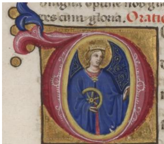
Figure 15. Image of Saint Catherine with attributes incorporated into the initial D(eus qui dedisti legem Moysi) . Wrocław, Biblioteka Uniwersytetu Wrocławskiego, ms. IF 396. Breviary of the Canons Regular of Żagań (1446), f. 206v.

D(eus qui dedisti legem Moysi) is complemented by golden ornaments. This is a figured initial beginning the oration performed at the end of First Vespers. In this case, it belongs to the office Inclita sanctae virginis .