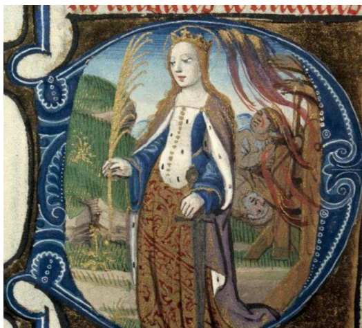
Figure 17. Image of Saint Catherine of Alexandria with attributes incorporated into the initial D(eus qui dedisti legem Moysi) . Clermont-Ferrand, Bibliothèque Municipale, ms. 69. Roman breviary (before 1482), f. 611v.