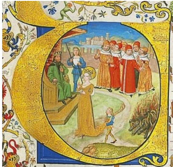
Figure 6. The scene of appearing before the emperor in defence of Christians incorporated into the initial V ( irginis eximiae ). Zürich, Schweizerisches Nationalmuseum, LM 4624-2. Breuiary (pars aestivalis) of Jost von Silenen, the bishop of Sion. (1493). f. 398v.

Christi gloriosa , which it was painted next to. Saint Catherine is depicted against a blue background with a crown and a halo, standing opposite Jesus, who is shooting arrows at her. One arrow is already visible in the Saint's body, near her heart. While this depiction is undoubtedly intriguing and rare, it is not the only one of its kind 38 . An explanation for the use of such a motif may lie in the idea of the mystical marriage, implying a spiritual union of the betrothed. It can also be interpreted as an example of courtly love, i.e. pure love based on spiritual connection 39 . It should be noted, however, that in Christian iconography, courtly love, celebrated by troubadours in the 12 th –14 th century, was symbolized by a lute, not a bow or another type of weapon. Therefore, it can be assumed that the aforementioned bow would be more apt for the mythological Cupid, whose attribute is the arrow of love 40 . This is how antique motifs were incorporated into Christian art, which was not a rare occurrence in the Middle Ages. Recognizing this depiction (which is very original and unusual) as a variant of the mystical marriage is a concept put forward by the author of this article. Nevertheless, it would be worthwhile to explore this issue further, which is a research proposal for the future.