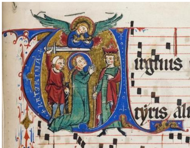
Figure 12. The scene of beheading incorporated into the initial V(irginis eximiae) . Karlsruhe, Badische Landesbibliothek, ms. St Peter 49. Antiphonary, pars de sanctis from southern Germany (ca. 1300 r.), f. 181r.

In Figure 11, a man bends over the reclining Martyr, who has golden hair and a blue gown, holding out a shining sword towards her. A ribbon with an inscription stretches out from Catherine to the heavens, symbolizing submission to God's will. The words on the ribbon are addressed to Jesus, whose head emerges from the clouds. The prayer reads: Expecto pro te gladium, Jesu Re(x) – “For your sake, King Jesus, I await the sword”; this is the third antiphon of Lauds (Figure 20) from the office Ave virgo speciosa , whose beginning ( initium ) in manuscript 4984 (Nürnberg, Germanisches Nationalmuseum, 1 st half of the 13 th century) is decorated by the illustration in question.