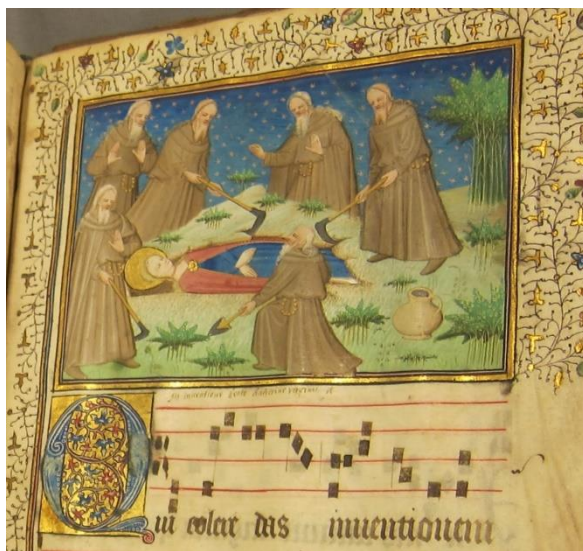
Figure 1. The beginning of the Qui colere office. The scene of the discovery of Saint Catherine's body by the monks of the Sinai monastery. Den Haag, Koninklijke Bibliotheek, ms. 76 E 18 (Parisian manuscript, ca. 1450), f. 95r.

A proposal of marriage to Emperor Maxentius also appears in the hagiography of Catherine of Alexandria. The Saint rejected the offer, which, according to some accounts, resulted in her being exiled; other sources state that she was sentenced to death and torture as a consequence. Some anonymous authors suggest that the emperor's proposal was brought about by a desire to deliver a beautiful girl from a martyr's death. Each version, however, highlights the motif of the Saint's mystical marriage as a reason for the rejection of the marriage proposal.