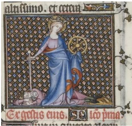
Figure 13. Image of Saint Catherine with attributes in the first nocturn. Paris, Bibliothèque Nationale de France, ms. lat. 1052. Parisian breviary of Charles V (1340–1380), f. 576v.