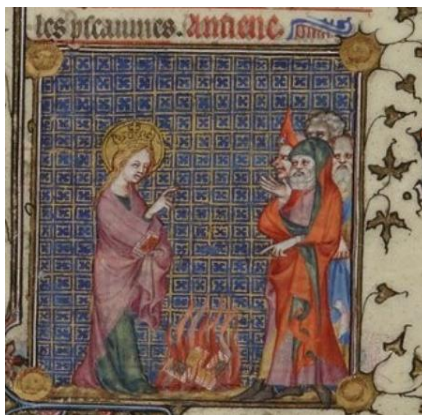
Figure 7. The scene of the disputation with scholars at the beginning of the office. Paris, Bibliothèque Nationale de France, ms. lat. 757. Franciscan missal and Book of Hours (14 th century), f. 424v, 430r.

The upper panel of the miniature – presented as Figure 5 – depicts the scene of Catherine's refusal to make a sacrifice to pagan gods. On the left, Emperor Maxentius is seated on a throne. He extends his hand towards a golden statue of an idol, commanding his subjects to worship it. Kneeling at his feet, they face the deity with obedience. On the opposite side of the illustration stands Saint Catherine, dressed in a green gown and covered by a red cloak. She holds a wooden wheel – the attribute of her later ordeal – and wears a golden crown atop her head, with a halo around it. Obedient to God's commandment, she turns towards Jesus and worships him, defying the emperor's will. The refusal to bow before the idol was emphasized with the position of the figures – the kneeling courtiers and the holy martyr facing away from the scene of honouring the pagan god 41 .