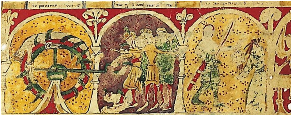
Figure 8. A cycle of hagiographic depictions of Saint Catherine placed before the title of the office. Madrid, Biblioteca Nacional de España, ms. 17820. Cistercian breviary El Antiguo from Santo Domingo de Silos (1246 r.), f. 1r.

The miniature presents the figure of the Saint standing on the left side and facing the debating philosophers, who are portrayed as old men with grey beards, wearing colourful robes. The martyr is dressed in a green gown underneath a pink shawl. In her left hand, she holds a red and golden book, and the index finger of her right hand is pointed at the interlocutors. Her head, adorned with a golden crown, is surrounded by a halo of the same colour. Between the Saint and the elders, there is a burning pile of pagan books, symbolizing the triumph of Catherine's faith and wisdom. The background is dark blue, with a golden geometric ornament.