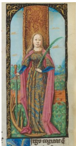
Figure 16. Image of Saint Catherine with attributes at the beginning of the office. Zürich, Schweizerisches Nationalmuseum, LM 4624-2. Breviary (pars aestivalis) of Jost von Silenen, the bishop of Sion (1493), f. 398v.