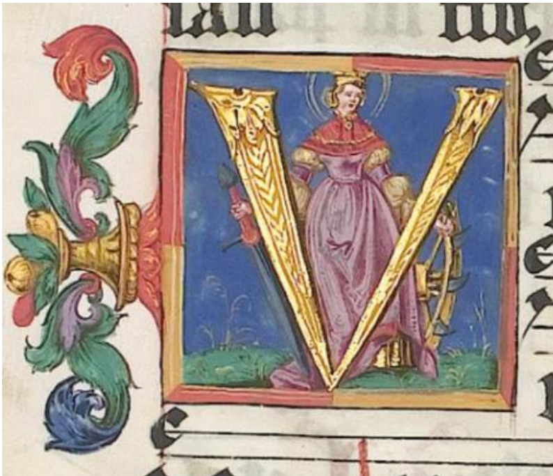
Figure 18. Image of Saint Catherine with attributes and the initial V ( irginis eximiae ). Darmstadt, Universitäts- und Landesbibliothek, ms. 29. Cantatorium from a Benedictine monastery, probably in Stein am Bodensee (1558), f. 36v.

The attribute which references the miraculous deliverance is the broken wheel. Depictions of such kind are shown in Figures 16 and 17. Figure 16 is not an initial; it is found at the beginning of the office which – unusually – begins with a capitulum . Unfortunately, the absence of an opening antiphon makes it impossible to determine which office it is. The miniature presents the fair-haired Saint standing in a golden gown decorated with green floral ornamentation, over which she wears a pink cloak. In her left hand, she is holding a green branch, and in her right – a sword driven into a broken wheel at her feet. The background features a forest landscape with hills and a vertical golden ornamental band behind the Saint. A similar scene is visible in Figure 17, a miniature incorporated into the letter D ( eus qui dedisti legem Moysi ). The oration is performed at the end of First Vespers, and in this case, the office begins with the aforementioned inscription, so the initial is visible directly under the title Catharinae virginis et martyris . The golden-haired Catherine, with a crown atop her head and a halo, stands dressed in a decorative gown and a cloak, holding a sword in her left hand and a branch in her right. The background features a hilly landscape and the broken wheel on the right, burning from flames raining down from the sky. Depicted below the torture device are the injured witnesses of the ordeal.