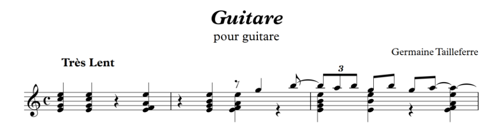
Sheet music example 4. Germaine Tailleferre – Guitare pour guitare vol. 1–3.

Germaine Tailleferre's solo piece for guitar is Guitare . It is a composition set in a very slow tempo – Très Lent , in quadruple meter, \frac{4}{4} . It has a homophonic texture consisting mainly of verticals chords (tetrads with a melodic line appearing in the highest voice. Guitare is difficult to define conclusively in terms of formal structure. The constant repetition of chords and the uncomplicated melodic line give the piece a contemplative and dreamy character. The texture in which the work is set is reminiscent of choral singing. The composition is written tonally, without key signature. The staid nature of the composition, the monotony of the chords, the non-guitar texture and the lack of proper arrangement and fingering make Guitare virtually absent from the recital programs of guitar virtuosos. The only guitarist who has recorded the piece is Otto Tolonen ( Guitar Re cital: Tiento Francais , Alba, 2013).