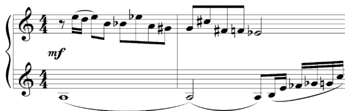
Example 2. Bars 1–2.

The cycle begins with a relatively small prelude (26 bars) of through-composed development, the first intonation of which is based on a 12-tone scale.