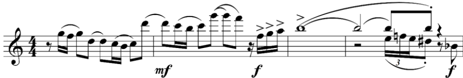
Example 4. Bars 5–8.

The prelude contains a number of performance and interpretation challenges. The melodic line of voices is full of elements that require meticulous performance: short phrase marks on two or three notes, tenuto , accents, staccato . The special, somewhat capricious nature of the prelude depends on the exact execution of these elements.