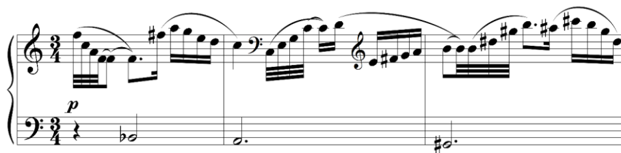
Example 7. Bars 1–3.

Prelude and Fugue in F major. The prelude is quite extensional in terms of volume, with through-composed development and improvisatory nature. The tempo and character are identified by the composer as Moderato capriccioso . The capriccioso nature of the image results from the frequent changes of the measure ( \frac{3}{4} , \frac{4}{4} , \frac{3}{8} , \frac{2}{4} , \frac{5}{8} ). The work begins with an expressive, graceful and extremely refined melody in F major, which is due to the capricious rhythmic patterns in the part of the right hand. The melody is characterised by the youthfulness and dreaminess of the image.