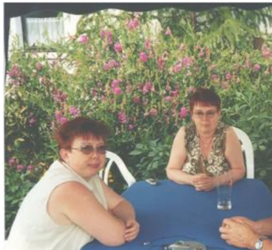
Photo 3. The photo entrusted by a patient

Similarities may refer to people, situations or the emotional climate of the photographs. Let us consider several examples. Photo 3 presents two women who are strikingly similar. The story accompanying this photograph reveals that they are a mother and an adult daughter. They are not only very similar in terms of physical appearance, but also generation differences between them are blurred (the same colour of dyed hair, similar clothes, dark glasses, etc.), which may be significant in script analysis. The woman in the background is the mother (aged 59) and the woman in the foreground is the daughter (aged 40).