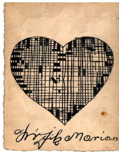
Photo 11. The reverse of the photo of a soldier