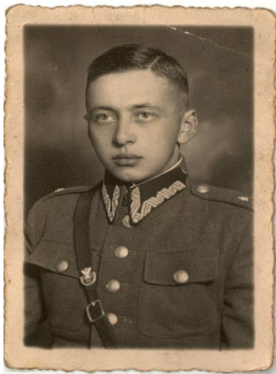
Photo 10. The photo of a soldier

Photographs sometimes hide a kind of a script secret, which can be solved only after many years. Photograph 10 was taken in 1948 in Poland. A young soldier fell in love with a slightly older girl and gave her his photograph. Then, their lives went along two separate paths. An elderly owner of the photographs claims that it has always had and still has a great influence on her life. She often looks at it and thinks of the boy who has not become her husband. In difficult moments of her life she looks at the photograph and goes back to the moment when she was loved by someone. Overleaf (Photo 11) a young soldier drew a heart and said that it contained a coded important message. The woman has not been able to decipher this intriguing message. After listening to the story, the therapist, to his amazement, solved the puzzle and read (it was enough to look at it from a certain angle): 'I remember and I love you'.