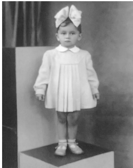
Photo 9. A photograph selected by the patient

The variation in which we have only one photograph from early childhood evokes comparisons between now and the moment in which it was taken as well as between the patients' current situation and their early life determinants. It is a look from the perspective of accumulated present experiences and memories from one's distant past. In a special way this moment identifies one's life script: an unconscious life plan based on early childhood decisions and illusions. It is not possible to unambiguously determine whether a person remains under the influence of script at present, although there are two factors which can be helpful: if the patients perceive their current situation as stressful, and if there are similarities between their current situation and stressful situations from their childhood.